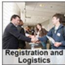
Registration and Logistics