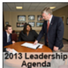
2013 Leadership Agenda