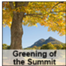
Greening of the Summit