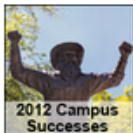
2012 Campus Successes

The Appalachian Energy Summit is the annual gathering of the University of North Carolina Energy Leadership Challenge. Through this initiative, campus leaders from across higher education in North Carolina share goals to reduce energy expenditures, transform energy utilization and reduce the environmental impacts of both higher education and the state.