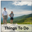
Things To Do