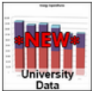
NEW University Data